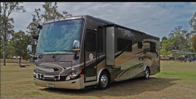
2013 'Silver Sand' – 40,000kms