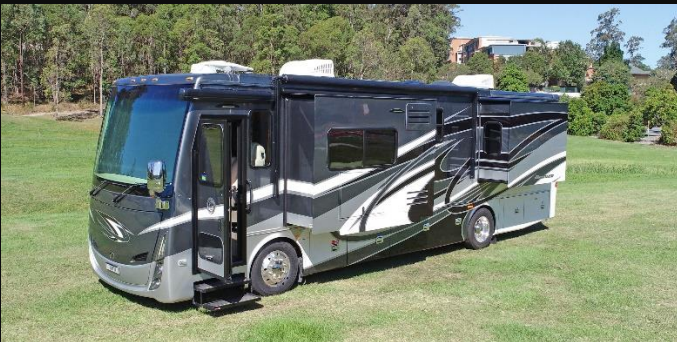
2018 'Sierra Mist' – 15,000kms

Three pre-owned and hardly used luxury motorhomes are currently with us for sale, We are assisting the current owners to find them new homes, the 2018 'Sierra Mist', 2017 'Nasa' and 2013 'Silver Sand' can all be found on our website with prices starting from as low as $285,000 plus on road costs, please check them out now and contact us if you are interested in taking a closer look.