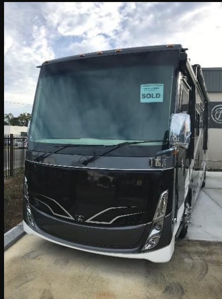
Brand New MY2020 - 'Sierra Mist' - SOLD !