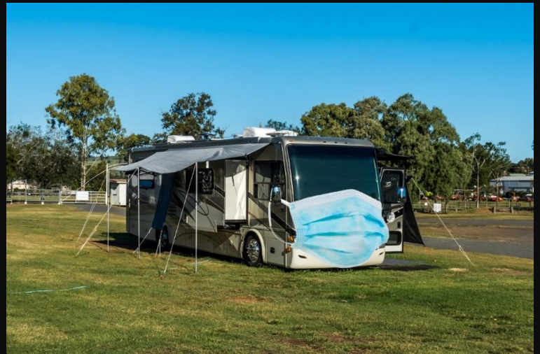
Even a Tiffin Motorhome learned how to take Covid-19 precautions !