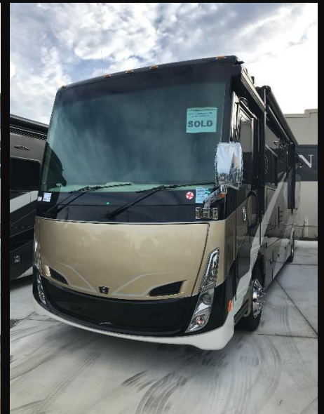
Brand New MY2020 - 'Gold Coral' - SOLD !