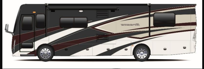
'Sierra Mist' MY2020