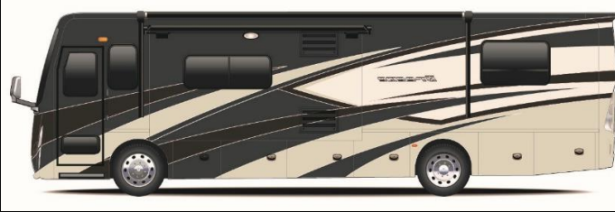
'Desert Sand' MY2020

As this winter issue of our newsletter is coming to you, there are five more brand new Tiffin motorhomes in 'the system' and on their way to Australia over the next few months, one is a special customer order but the remaining 4 are available to secure and avoid the normal 6mth lead time; 'Desert Sand', 'Sierra Mist', 'Waterfall' and 'Snowy Mountain' are heading this way so if as you read this you are thinking to yourself.... maybe this is the time...then don't hesitate, contact us now to find out more !