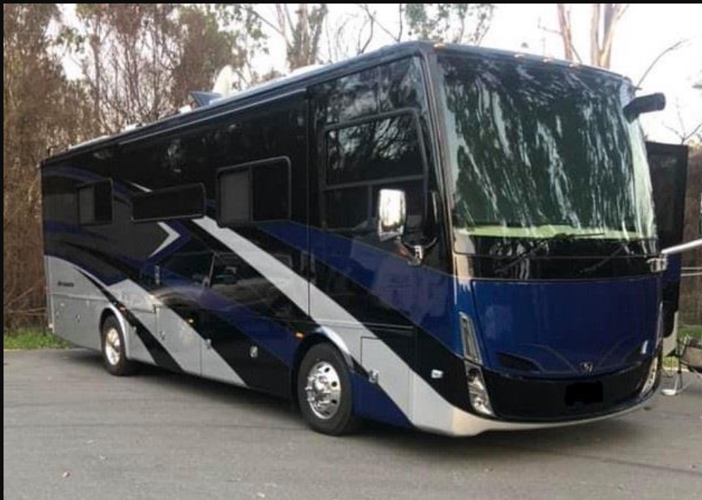
The first MY2020 Tiffin Allegro Breeze 331BR to hit Australian shores !

This past Autumn saw the highly anticipated arrival of the very first MY2020 model Tiffin Allegro Breeze 331BR motorhome. Angela & Michael from Victoria were the first to snap this beauty up after placing their order in July 2019 for a stunning custom colour scheme 'Waterfall' ticking almost every option box. I am sure it was a very long six month wait for them. They took delivery in mid March and after a brief preparation period, took off on the first of what I am sure will be many journeys to follow.