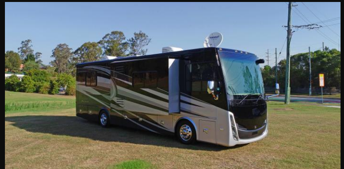
2017 'Nasa' – 12,000kms